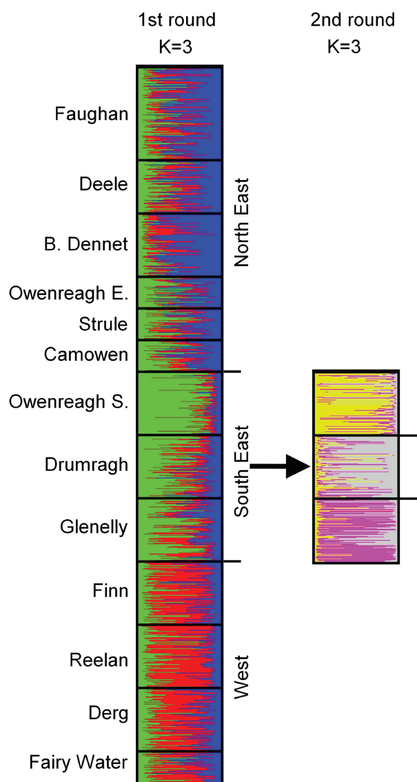
Figure 3. STRUCTURE bar plots (aligned using CLUMPP) depicting population structure based on two hierarchical rounds of analysis; K = 3 (first round, left) and K = 3 (second round, right) where membership of each individual to the different clusters can be deduced from the proportion of each color in the bars.

previously estimated and presented insofar as microsatellite data are concerned.